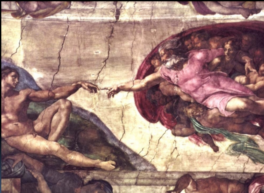
Image from the Sistine Chapel

“There has also been a scholarly effort to locate Sophia historically as the goddess of wisdom within the context of Christian religious practices, texts, and images. One of the most interesting theories relates to Michelangelo's paintings on the Sistine Chapel ceiling. Some scholars and art historians believe that the female figure under God's left arm in the Creation of Adam is, in fact, Sophia, acting out her role as the female being in the creation of life and man. “*