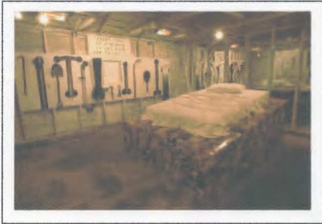
Figure 3. Rape Garage

I then went upstairs with my guide. Again I faced a room that immediately captured my attention as a potential topic for my studies: Nightmare Nursery . In this child's bedroom filled with a twin-sized bed and toys, words conveyed a sense of underlying angst despite the room's superficial tranquility. Scratched into the black paint that covered the windows were the phrases: "fear, stop, help me, Mommy!!!" and "alone, help, pain." The darkened windows blocked light and also viewing from the outside. This, along with a nightlight, suggested nighttime. Large blue footprints moved from the doorway to the child's bed, and a shadowed hand loomed above in the ceiling. Five belts and a strap hung on the wall, indicating the potential of domestic violence. Toy blocks on the floor spelled out the word "ugly," while scribbled words covered the walls: "shut up," "freak," "nerd," "dumbo," "stupid," "pansy," "ugly," "freak of nature."