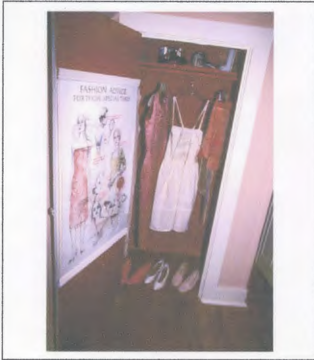
Figure 1. Abuse Closet