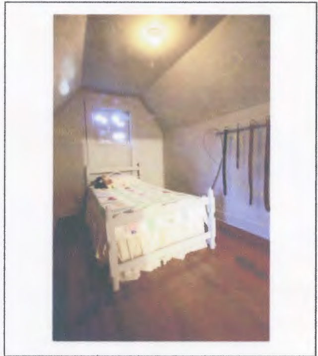
Figure 2. Nightmare Nursery

predecessors had addressed and included a new, third-wave lens, through which to study violence in American culture: violence against the male body. They revealed the underside of American domestic family life—violence and prejudice—showing what resides in the garage, bedroom, and closet as the foundation of everyday American family life. These, at least, were my scholarly thoughts as I viewed the At Home Project , taking copious notes as I viewed each installation.