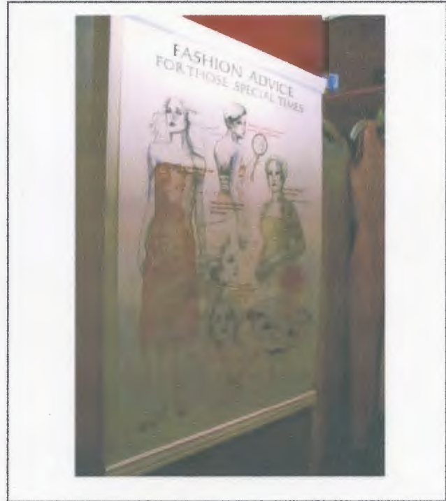
Figure 4. Fashion Advice Poster

Located in the center of this room was a bed. Placed on a tilted platform against a shattered mirror, this king-sized bed was covered with images from a multitude of pornographic magazines, forming a dizzying collage. One photograph on the bed completely absorbed me: a black and white pornographic picture from the 1950s or 1960s in which a man,